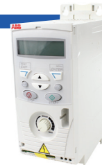
Drive Motors & Accessories