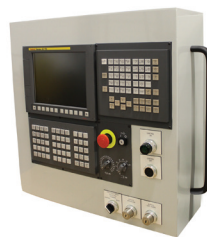
NC/CNC & Robotics