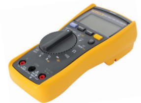
Test & Measurement