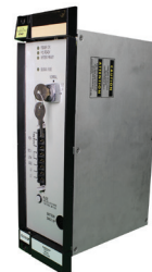
Power & Electrical